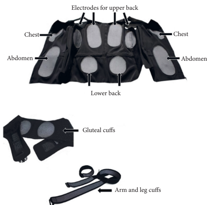
FIGURE 1: WB-EMS electrodes (grey area) of the WB-EMS equipment used in the underlying trials.

reporting \geq 5 for pain frequency and \geq 4 for pain intensity at the LS. “5” indicated “frequent to very frequent” pain sensation (or severe pain intensity) and “4” “moderate” pain intensity.