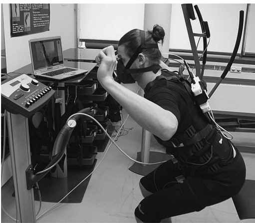
Figure 2. Shoulder press combined with the squat exercise with whole-body electromyostimulation equipment during the resistance protocol. All the exercises were performed in a dynamic mode.

Large methodological differences become apparent, which prevents a meaningful comparison of our data with studies using local EMS approaches (2,5,8,24). This especially refers to the local application with small electrodes, the immobilization of the resting muscle group (by fixation of the limb), the application of low current intensity (e.g., 25% of the MVC), and the choice of different endpoints (e.g., energy-rich